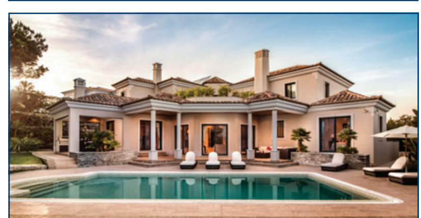
PORTUGAL, ALGARVE, QUINTA DO LAGO

Guide £2.2 million canfordcliffs@savills.com +44 (0)1202 708888