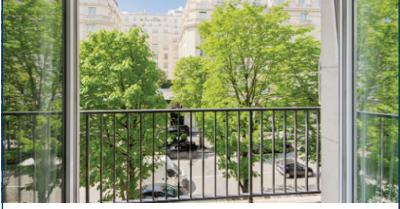
PARIS, TRIANGLE D'OR 75008

3rd floor corner apartment ◆ entrance hall ◆ large rotunda living room ◆ dining room