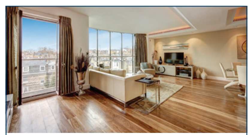
LONDON, KNIGHTSBRIDGE SW7

Guide €1.35 million adudley@savills.com +44 (0)20 3813 3840