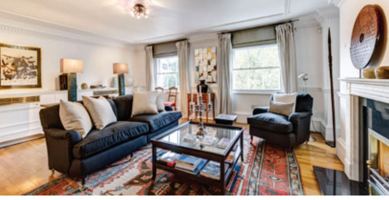
LONDON, BELGRAVIA SWI

3rd floor apartment within listed building ◆ 2 bedroom suites ◆ lift ◆ porter ◆ key holding service ◆ access to private gardens and tennis courts