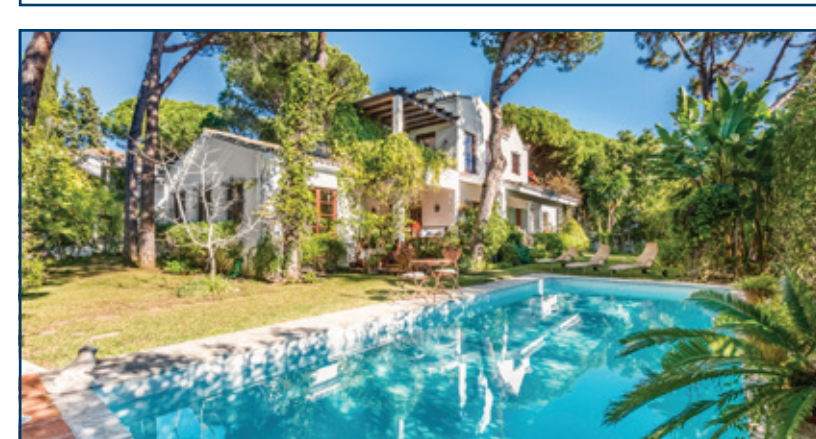
SPAIN, MARBELLA, GOLDEN MILE

Guide €4.725 million jcvjetkovic@savills.com +44 (0)20 3813 3840