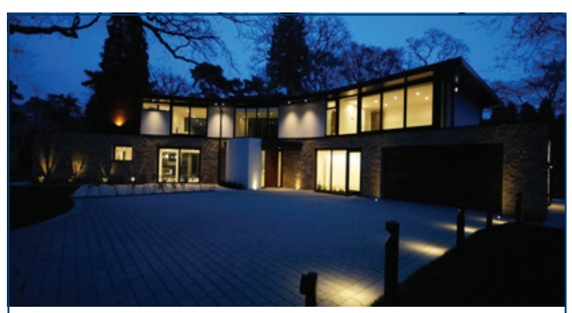
ENGLAND, POOLE, BRANKSOME PARK

Guide £1.55 million hbrowne@savills.com +44 (0)20 7581 5234