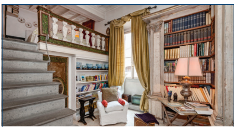
ROME, HISTORIC CENTRE

Guide €2.5 million jcvjetkovic@savills.com +44 (0)20 3813 3840